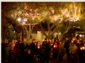
San Luis Obispo 11/19 Mission