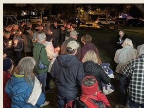
South County 11/20 Arroyo Grande