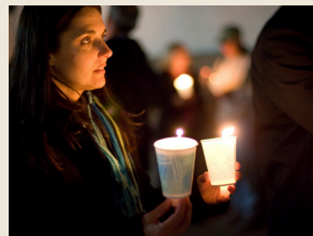
North County 11/12 Templeton