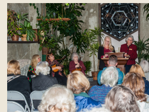
North Coast 11/13 Morro Bay