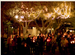
San Luis Obispo 11/18 Mission