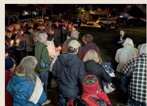
South County 11/20 Arroyo Grande