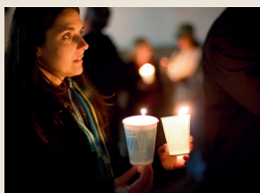
North County 11/12 Templeton