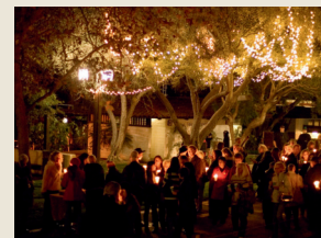
San Luis Obispo 11/19 Mission