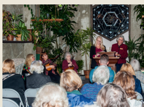
North Coast 11/13 Morro Bay